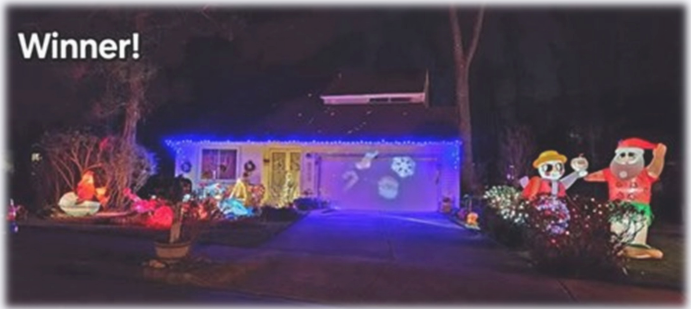
The Syverson Family was Number 1!