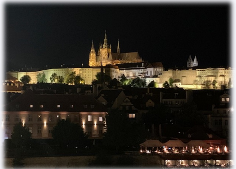
Prague Castle and Palaces