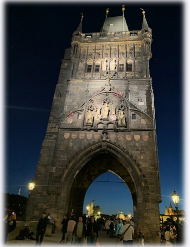
The Gate to Charles Bridge