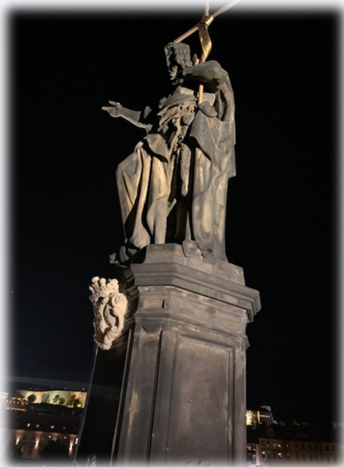
Statues on Charles Bridge